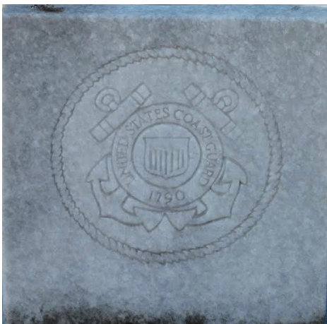
U.S. Coast Guard