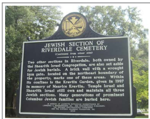
Historic marker in Riverdale Cemetery