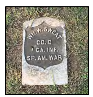
The Union Shield

The U.S. Department of Veterans Affairs (VA) furnishes a Government headstone or marker at no cost for the unmarked grave of any eligible Veteran in any cemetery around the world, regardless of their date of death. If the grave of a Veteran already has a privately purchased gravestone or marker, he or she may still be eligible for a Government memorial depending on dates of service and date of death.